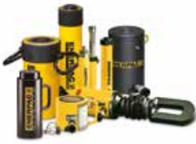
Cylinders & Lifting Products