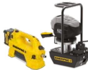
Cordless Hydraulic Pumps